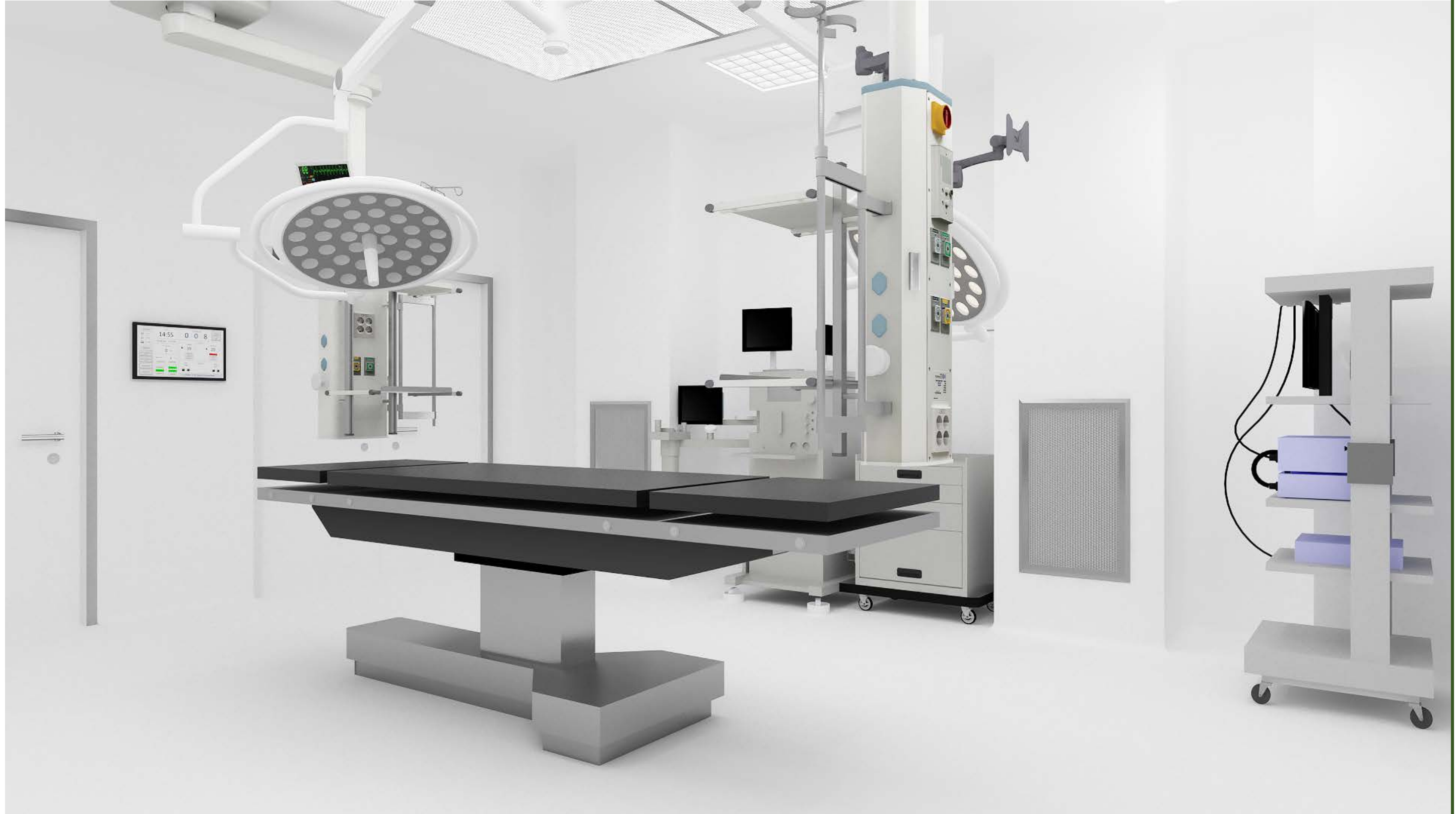
T624 – GENERAL SURGERY VIEW 3