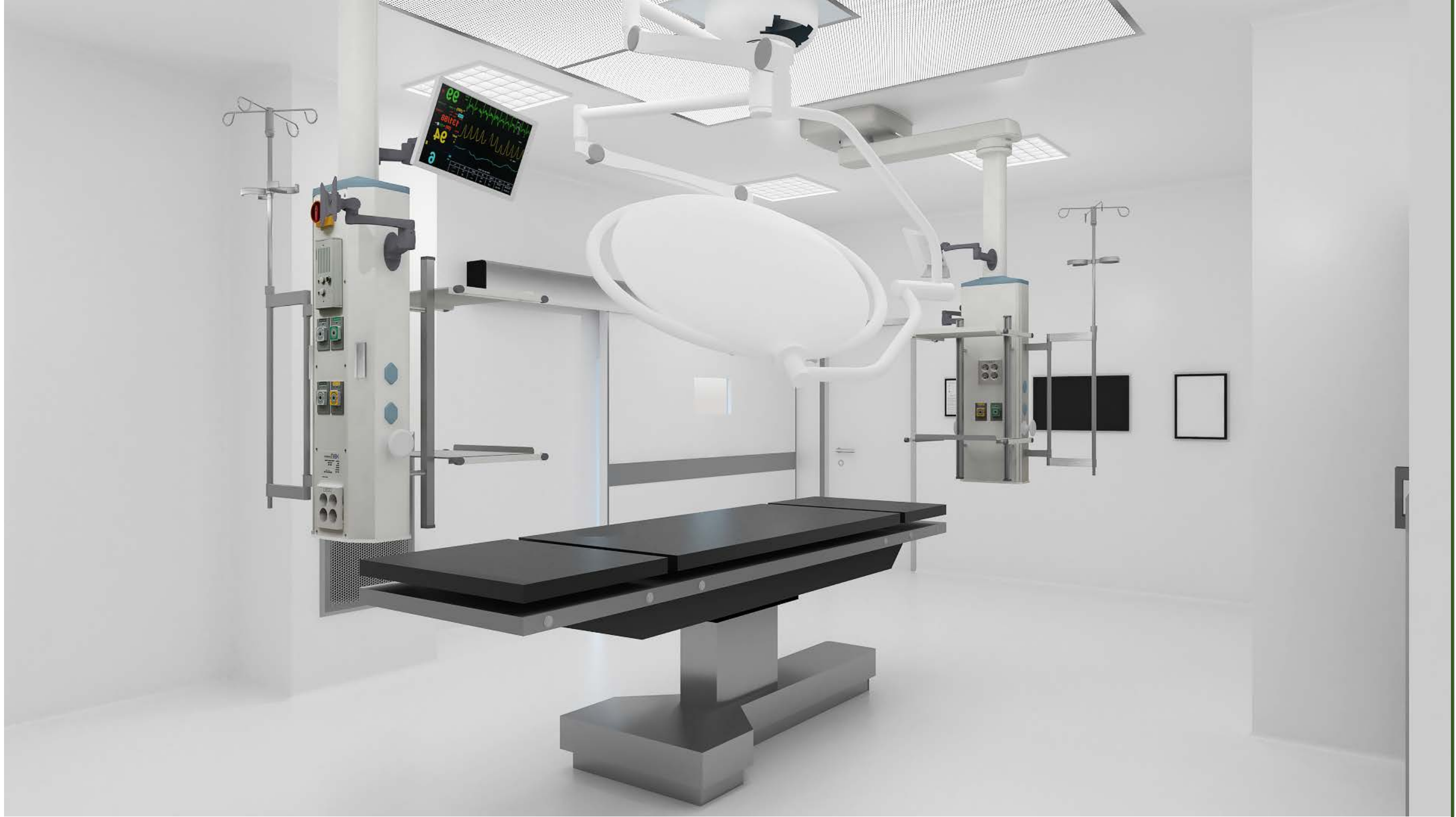
T626 – ORTHO THEATRE VIEW 3