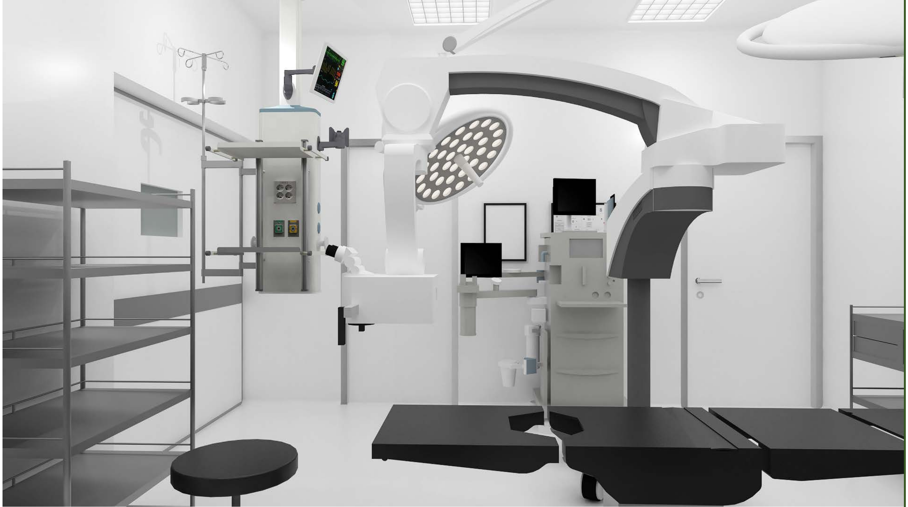
T623 – OPHTHAL THEATRE VIEW 3