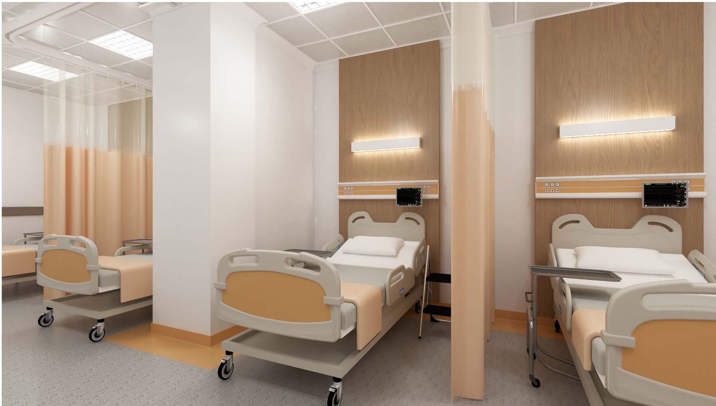
T619 – POSTOPERATIVE ROOM VIEW 2