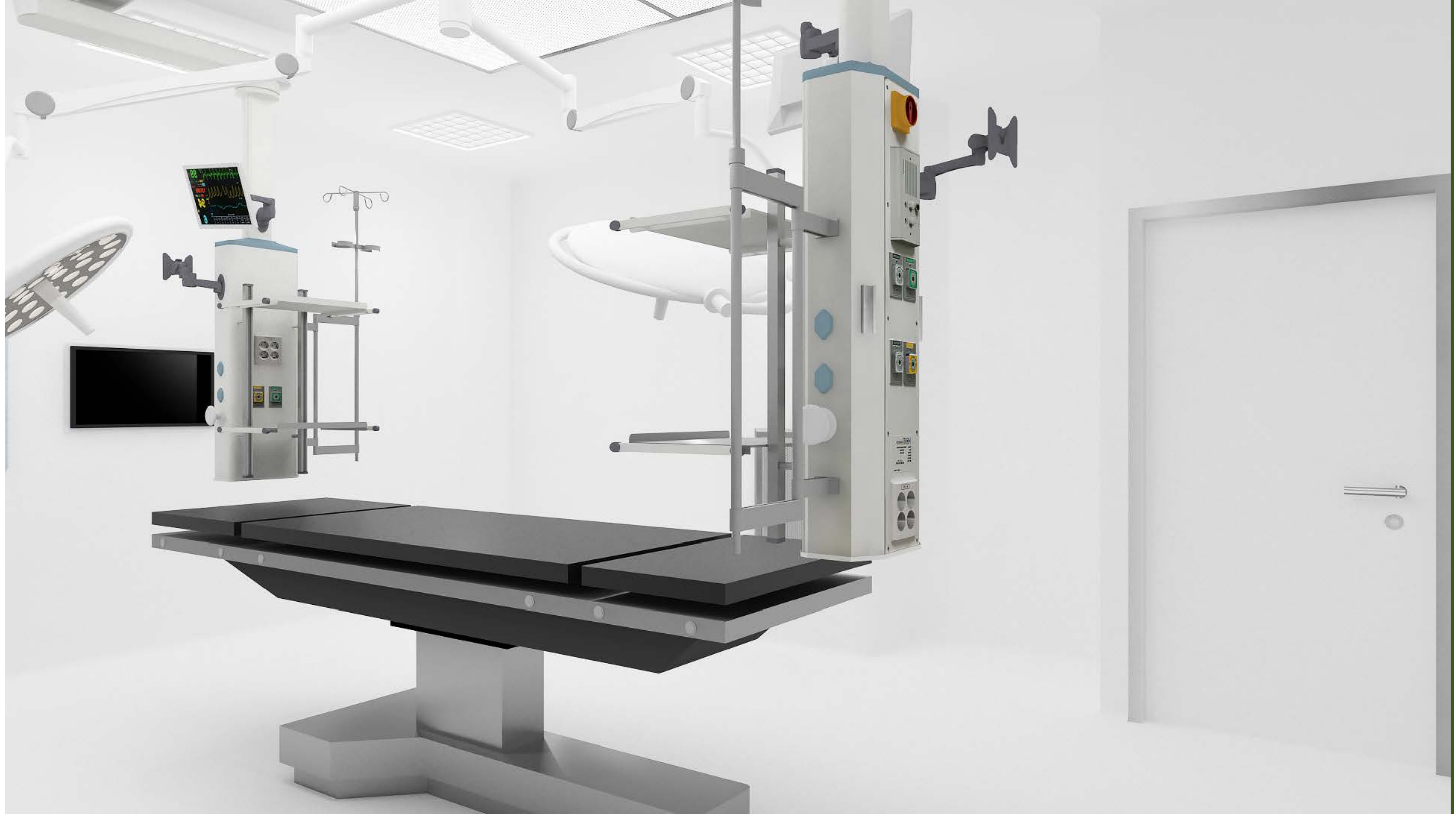
T624 – GENERAL SURGERY VIEW 1