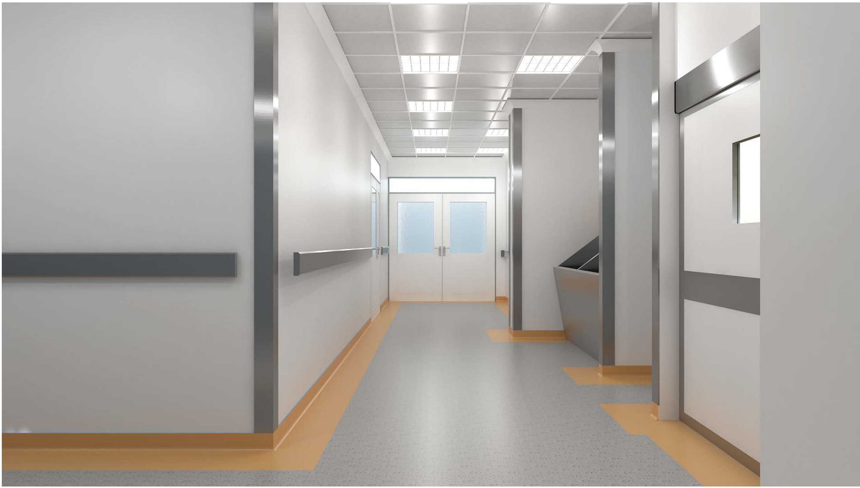
T621 - STERILE CORRIDOR