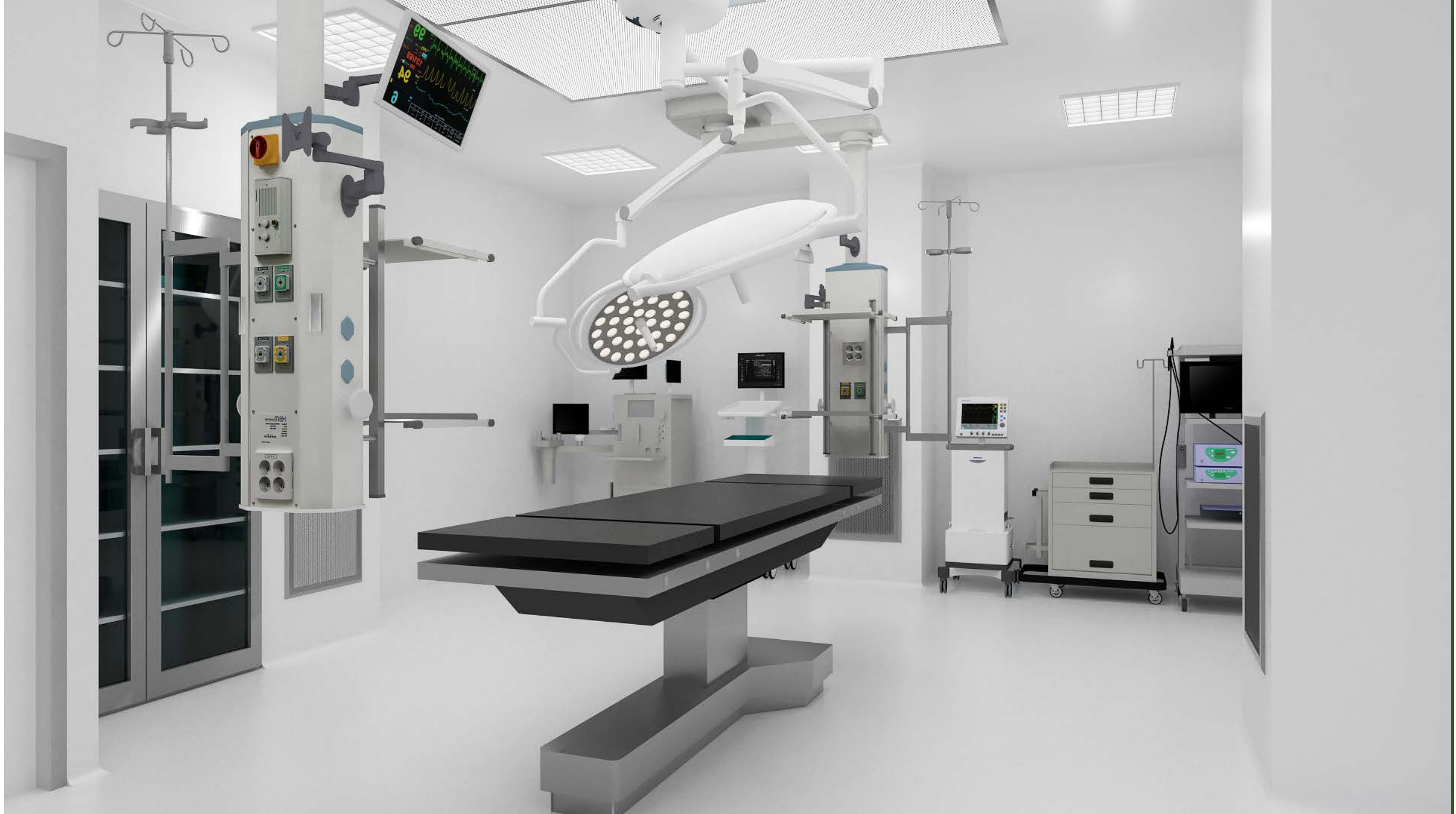
T626 – ORTHO THEATRE VIEW 1