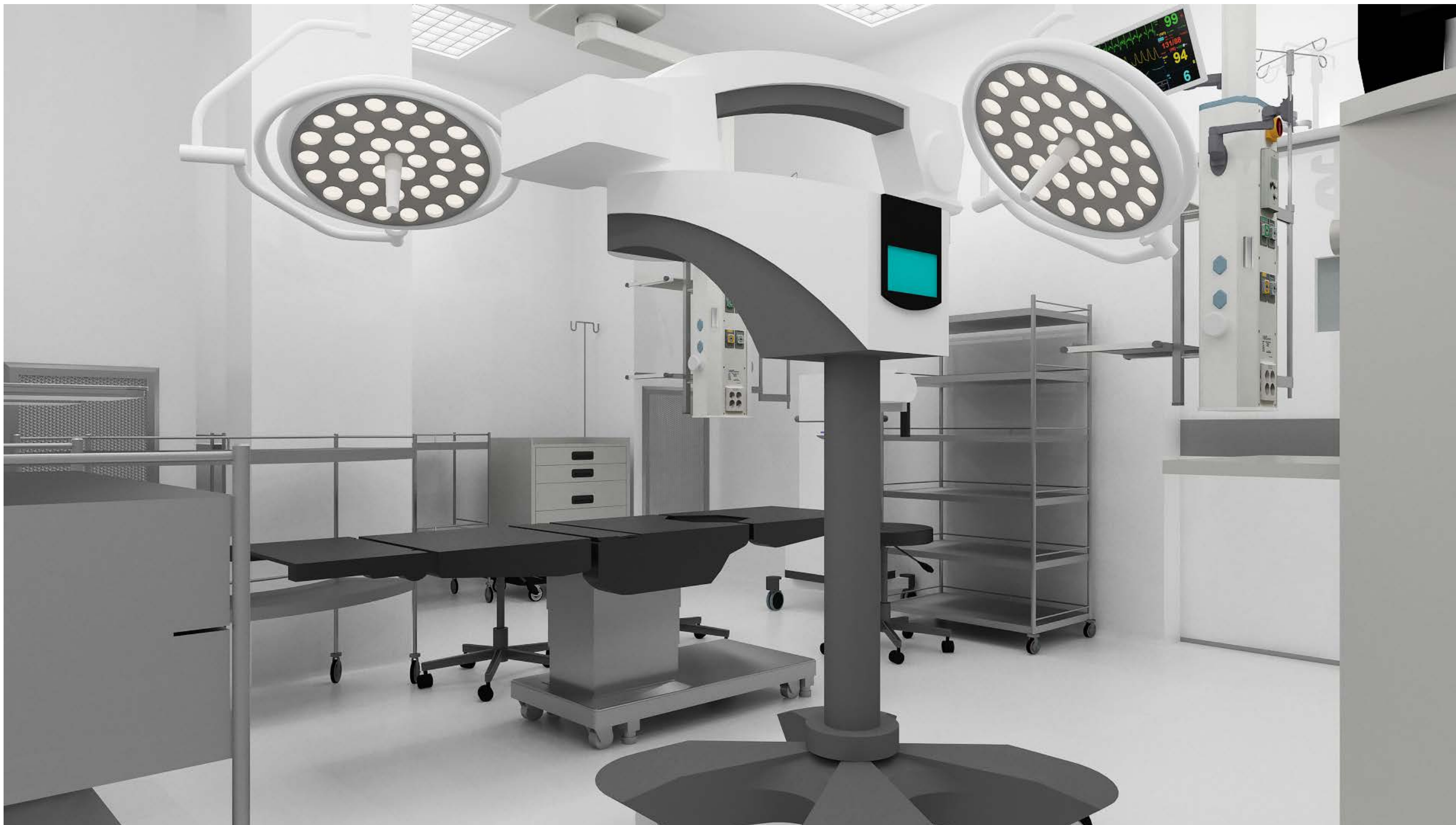
T623 – OPHTHAL THEATRE VIEW 2