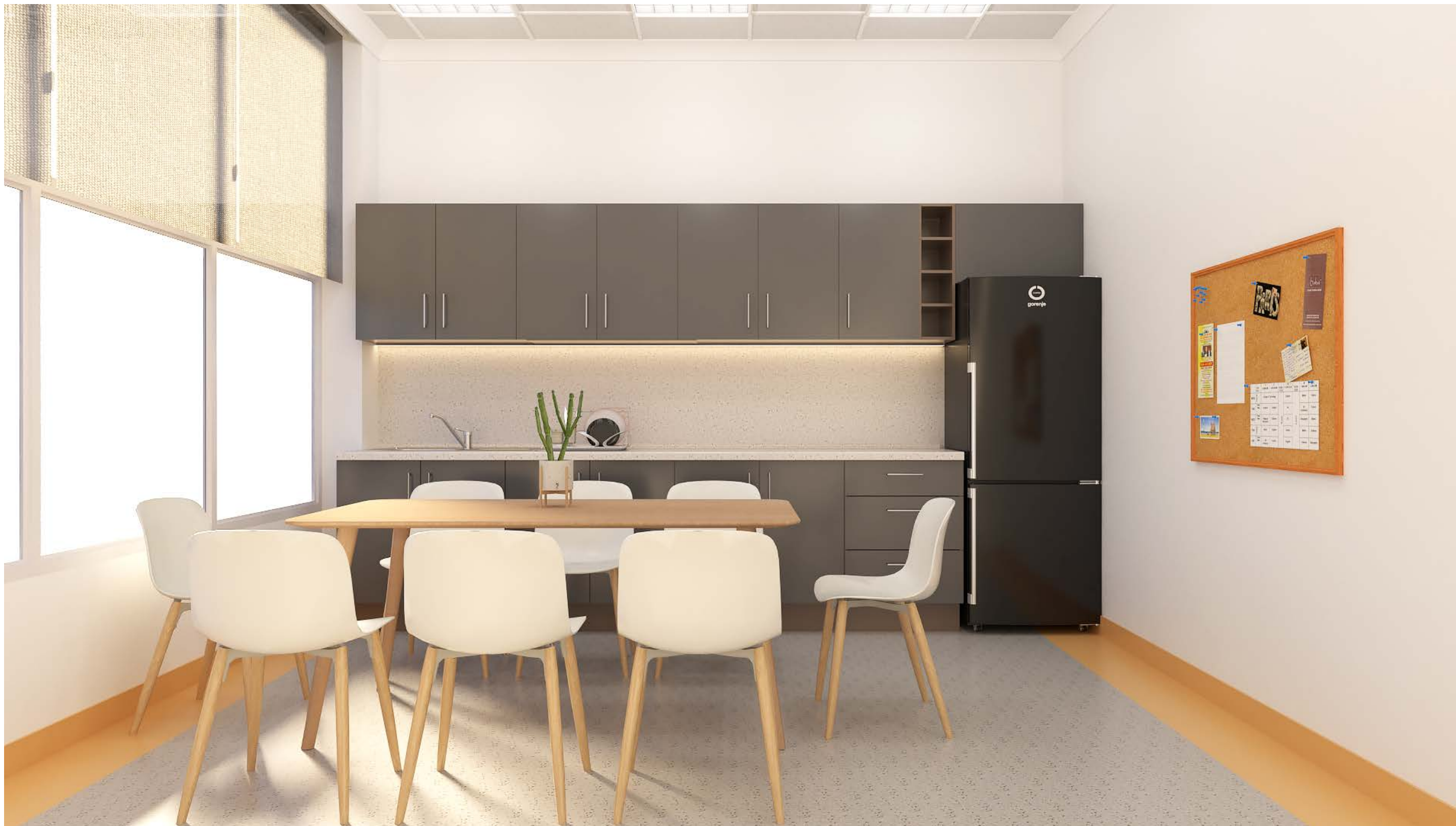
T608 - TEA ROOM