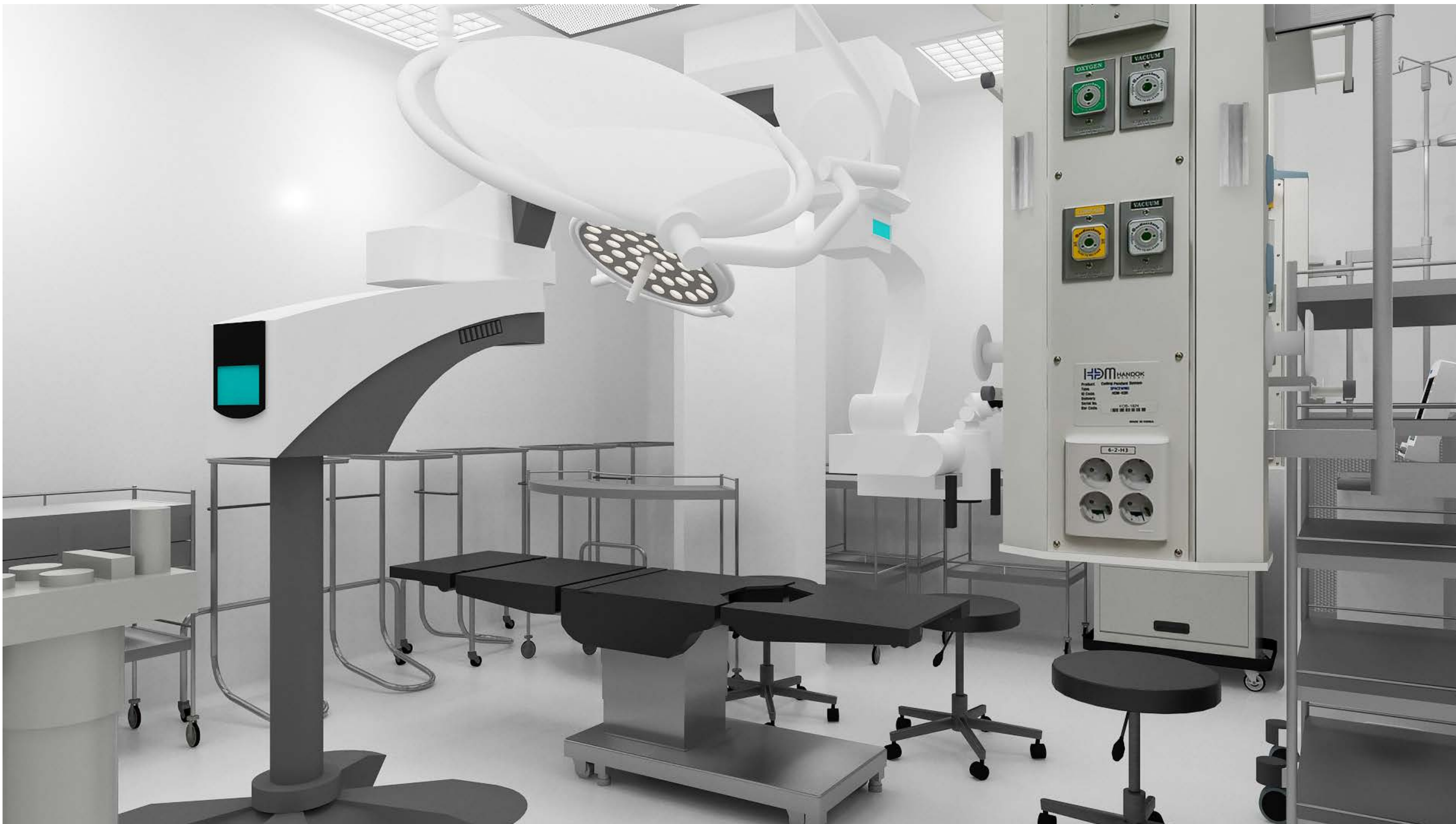
T623 – OPHTHAL THEATRE VIEW 1