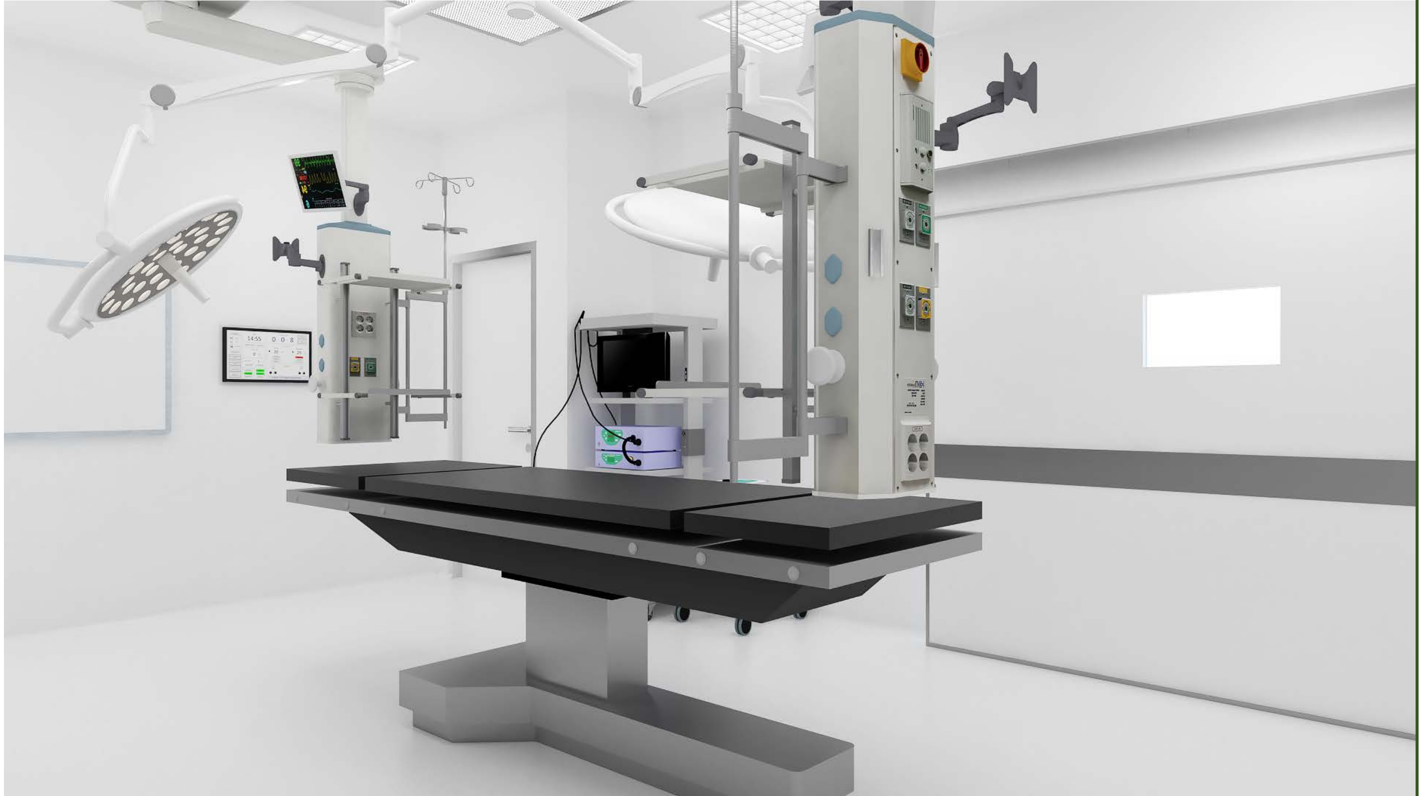
T626 – GYNAE THEATRE VIEW 3