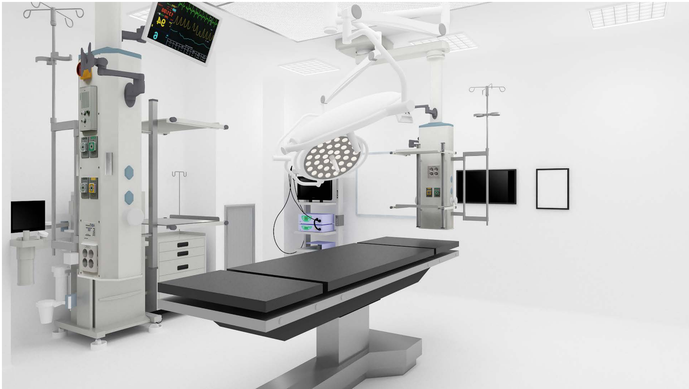
T624 – GENERAL SURGERY VIEW 2