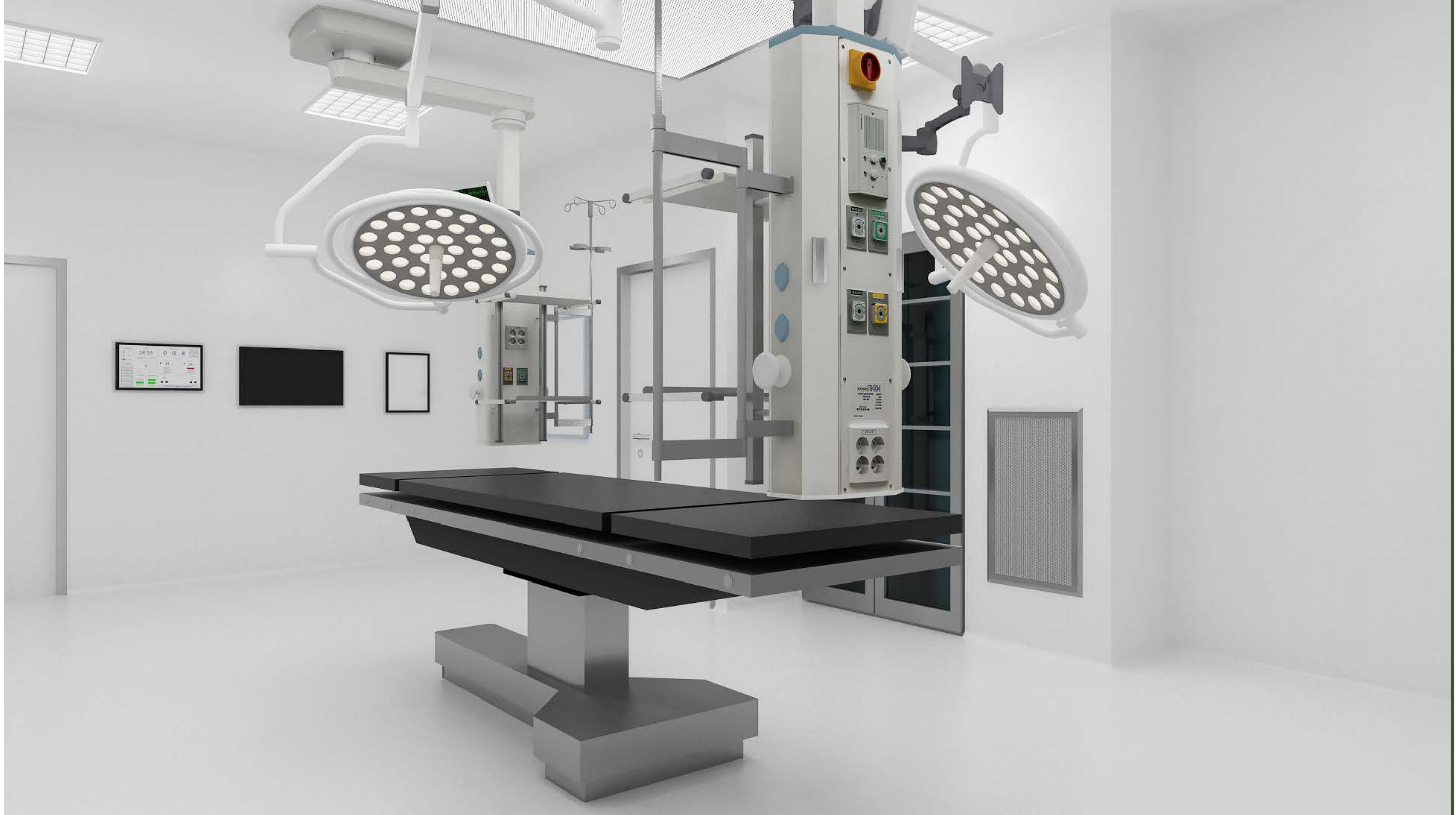
T626 – ORTHO THEATRE VIEW 2