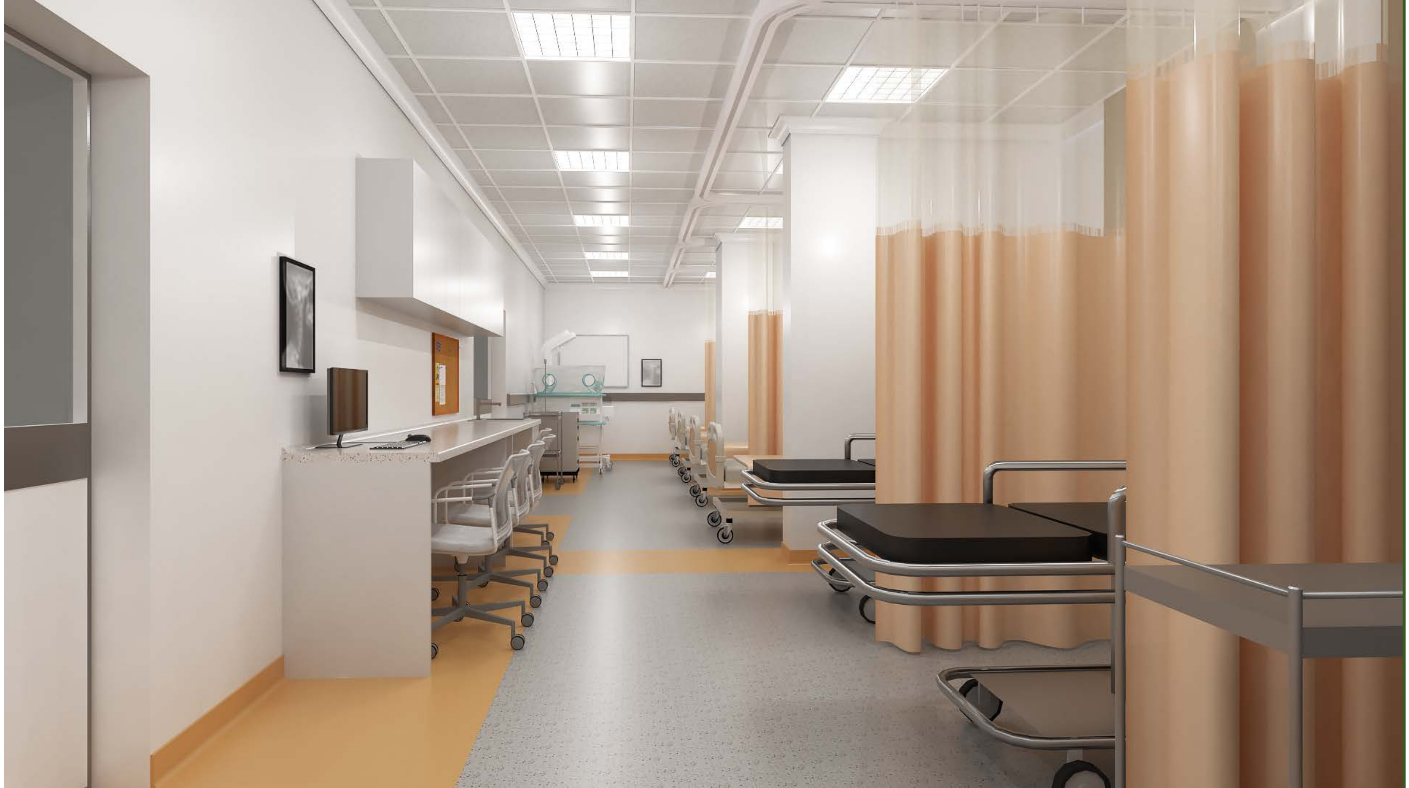
T619 – POSTOPERATIVE ROOM VIEW 1