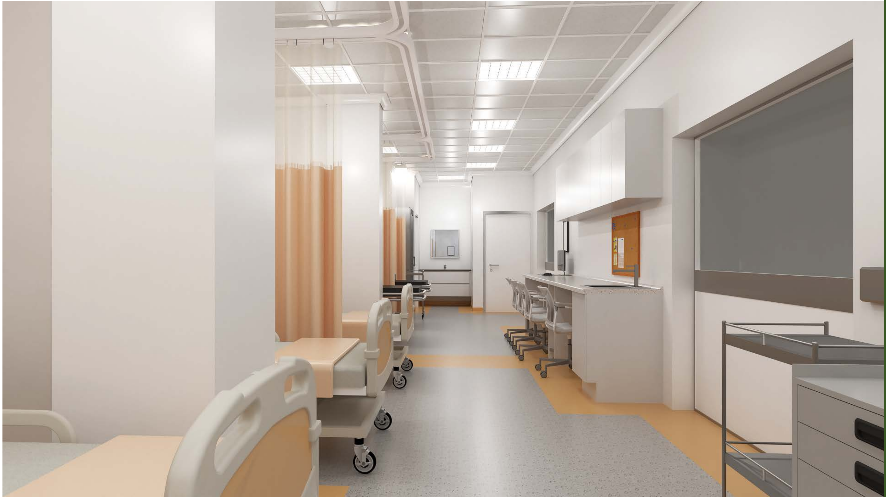
T616 – PREOPERATIVE ROOM VIEW 1