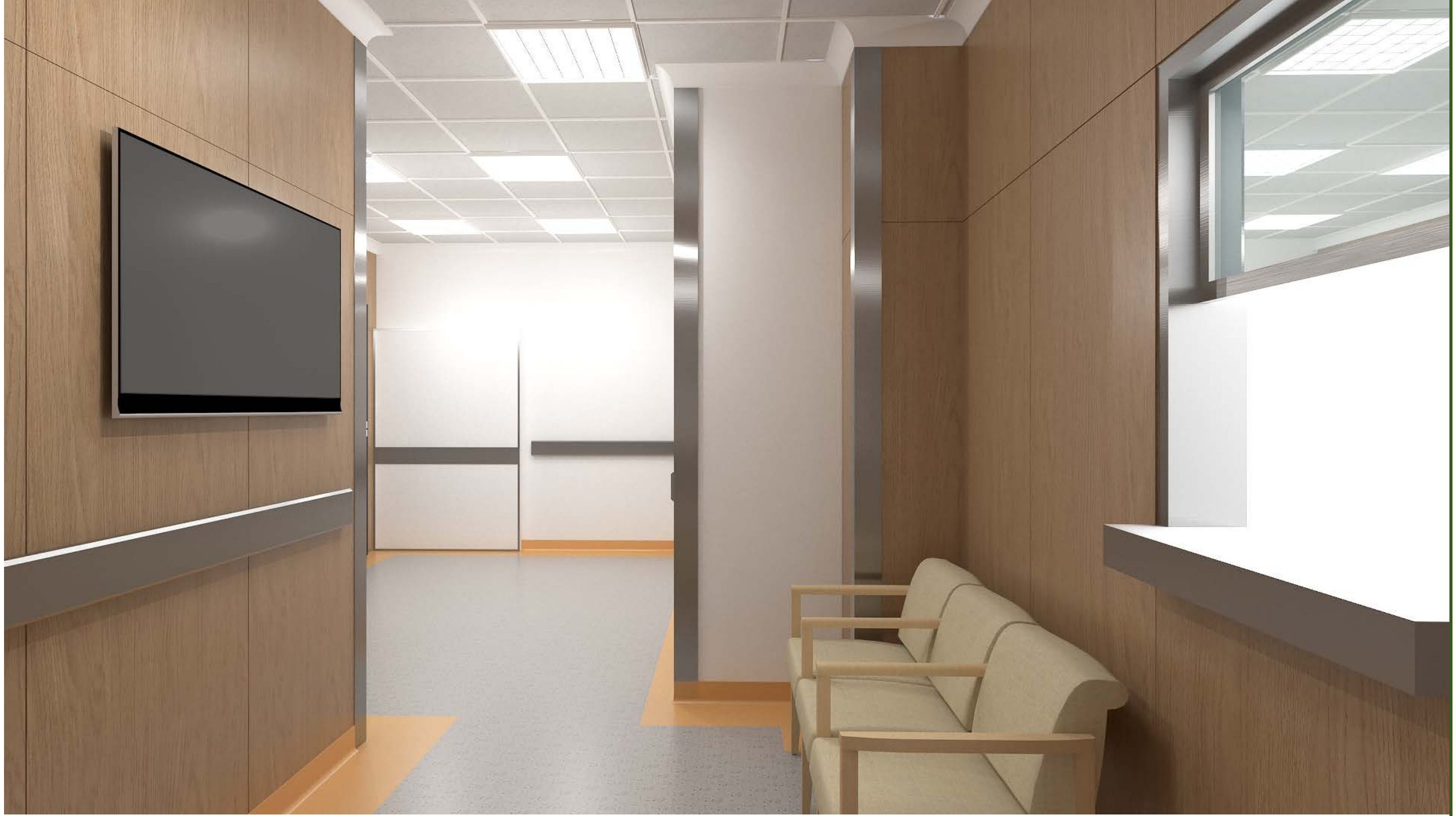
T601 – LOBBY AND WAITING AREA