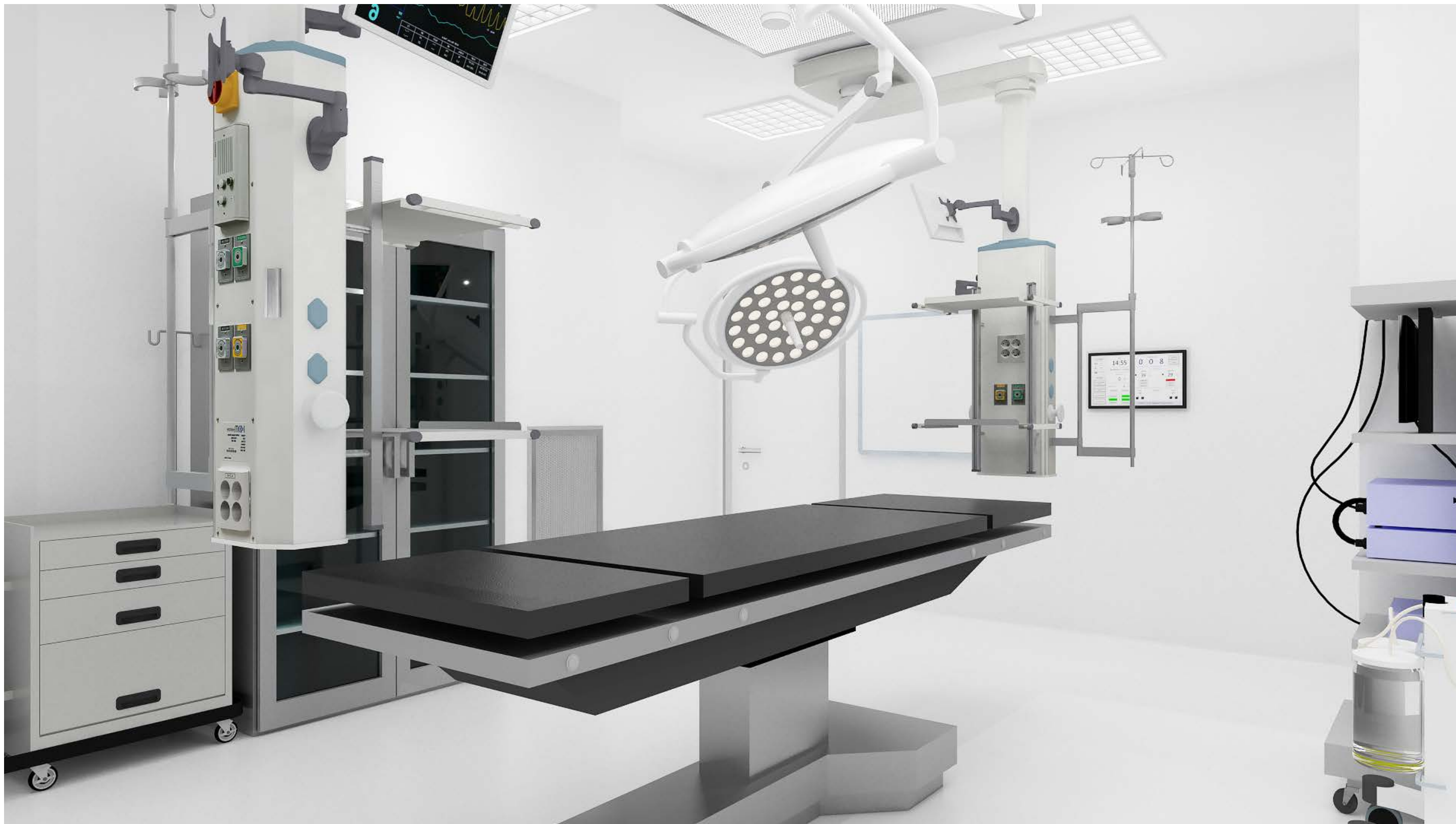
T626 – GYNAE THEATRE VIEW 2