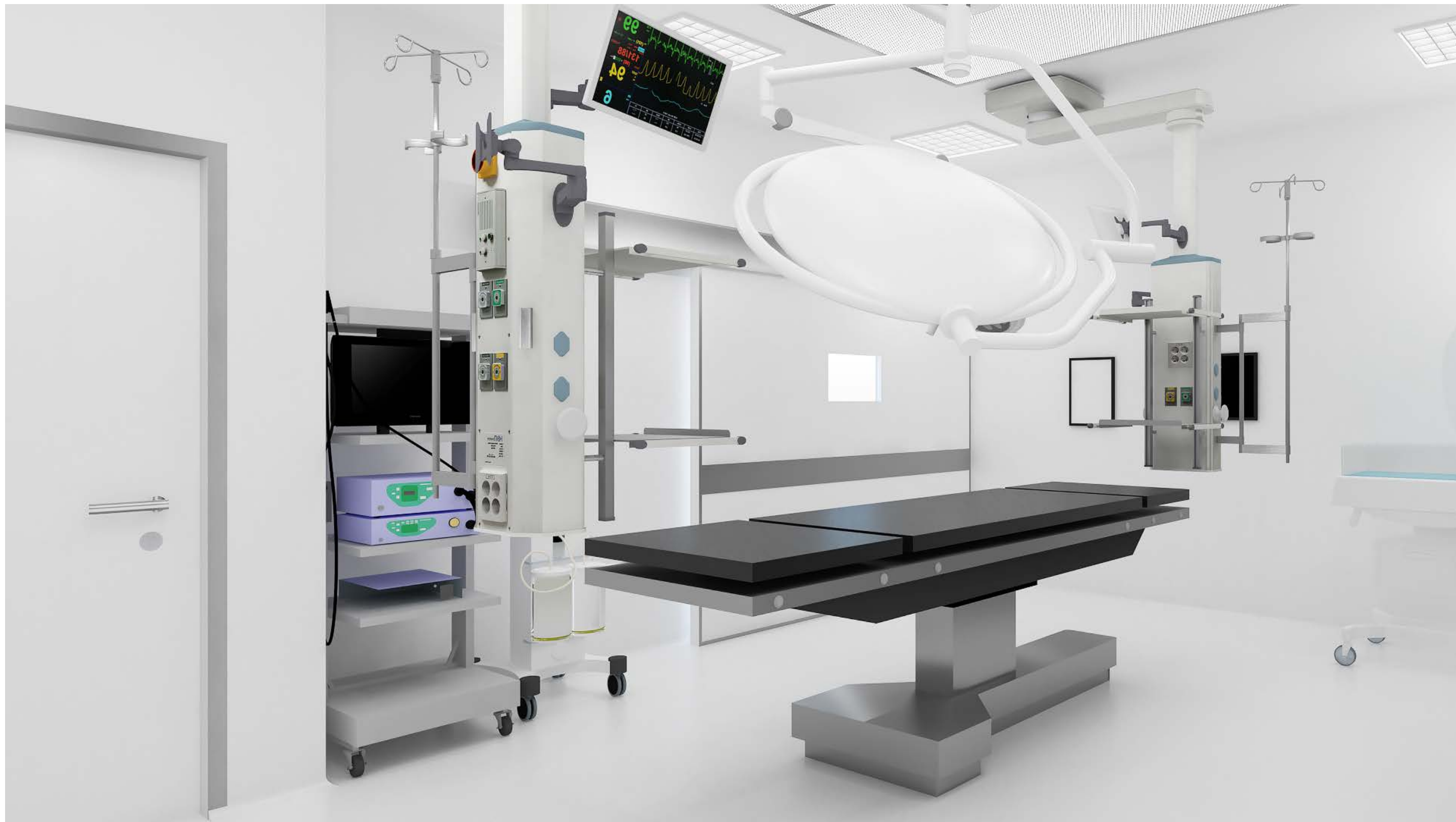
T626 – GYNAE THEATRE VIEW 1