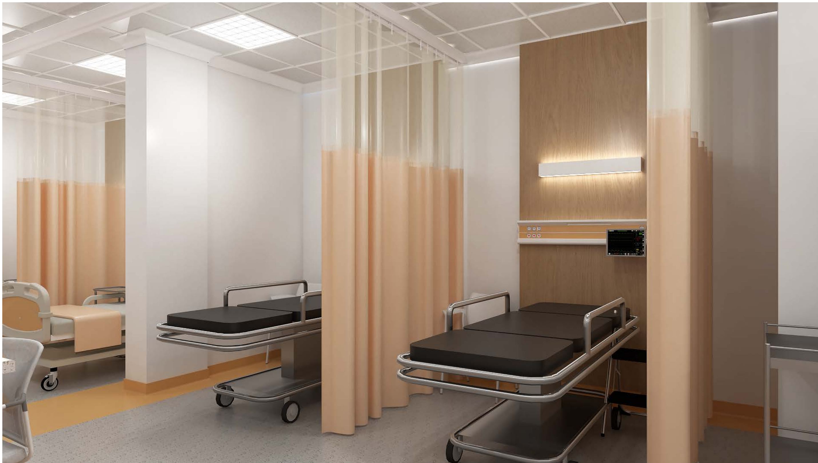
T616 – PREOPERATIVE ROOM VIEW 2