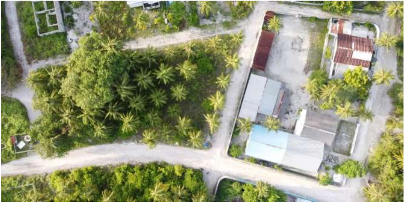
Existing Vocational Training building + the new land space(R.Alifushi)

Plot area available for the construction and development of TVET Center and Accommodation Block in R.Alifushi is 38,328 square feet (sq. ft). Under the Public-Private Partnership model, the private partner (an industry representative) may utilize the land area for other revenue generating options, provided that it does not affect the primary goals of these institutes and shall be approved from MoHE.