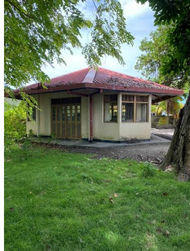
Existing facilities in the Regional Vocational Training Center , K. Thulusdhoo