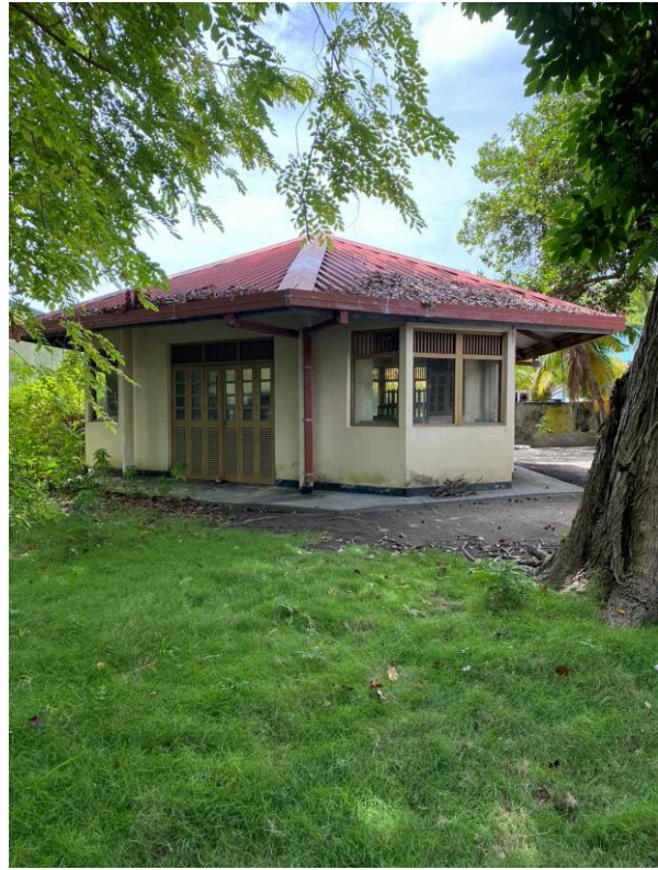
Existing facilities in the Regional Vocational Training Center , K. Thulusdhoo