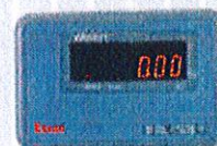
Remote Display (Wall Mounting)