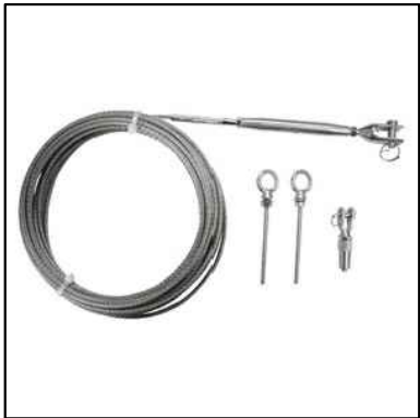
TENSION WIRE KIT